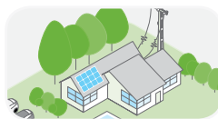
Residential grid-tie solar with backup power