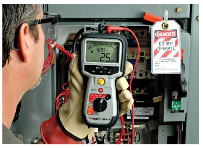
Panelboard testing is faster, easier and safer with the new MIT400 Series.