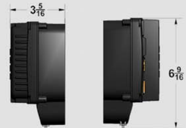
View with wall mount