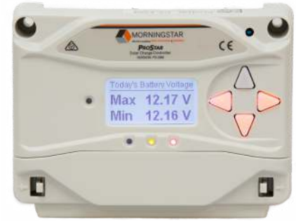
New ProStar (Gen3) shown with optional meter

The ProStar solar charge controller has been the leading mid-range pulse width modulation (PWM) controller since 1995. With over 350,000 units installed in the harshest environments in over 100 countries, the ProStar has developed a strong reputation for reliable performance. This third generation ProStar maintains the same quality and form factor as previous models, while offering new data, lighting control, graphical interface, and protection features to better meet the needs of off-grid solar applications.