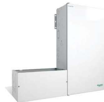
XW+ Power Distribution Panel