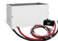
XW+ Installation Kit for INV 2 INV 3 PDP