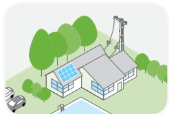
Residential grid-tie solar with backup power